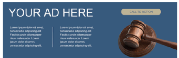
Footer Banner 600 X 200 pixels