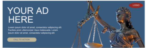
Header Banner 600 X 200 pixels

All artwork must be submitted electronically (preferably in a high-res PDF file) to swilkinson@wyomingbar.org . Other acceptable formats are .tif or .eps with a resolution of 300 dpi or better. All ads must be CMYK. RGB is not acceptable. Design assistance is available to advertisers for the preparation of their advertisement for an additional fee.