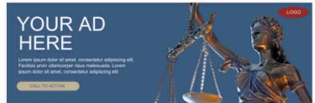
Header Banner 600 X 200 pixels

All artwork must be submitted electronically (preferably in a high-res PDF file) to swilkinson@wyomingbar.org . Other acceptable formats are .tif or .eps with a resolution of 300 dpi or better. All ads must be CMYK. RGB is not acceptable. Design assistance is available to advertisers for the preparation of their advertisement for an additional fee.