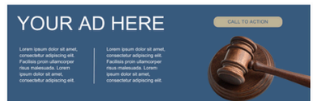
Footer Banner 600 X 200 pixels